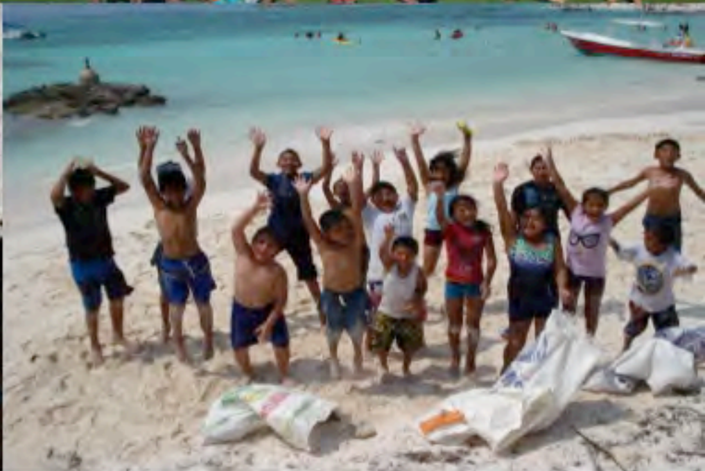
IV Community Involvement/Service Learning: Students from Wilton Manors Elementary in Pompano Beach and students in Tulum, Mexico participating in a collaborative beach cleanup.